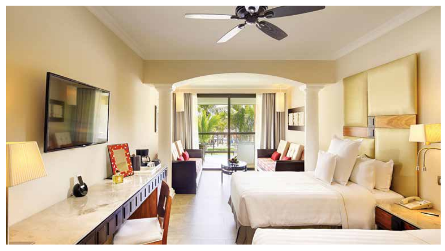
Junior Suite Ocean Front Club Premium