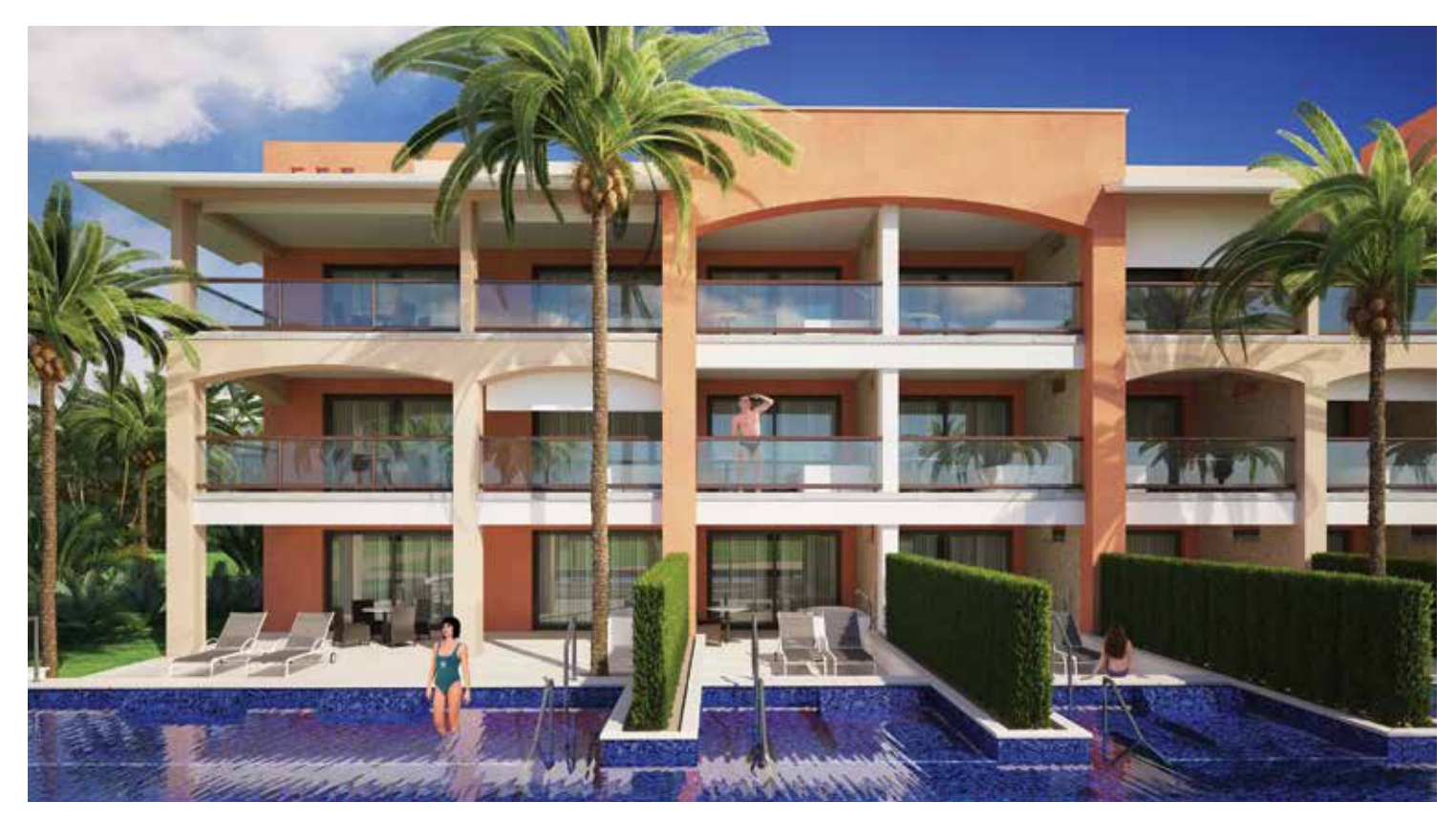
Junior Suite Swim Up Club Premium | Suite Swim Up Club Premium