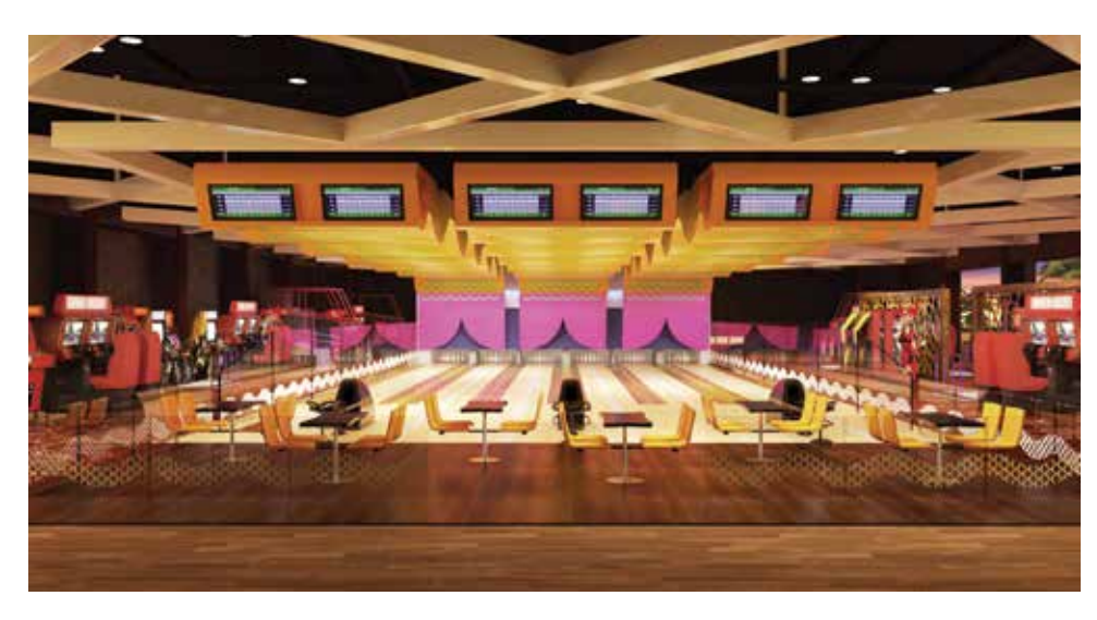
10-Pin Bowling Alley & Arcade

Open from 9:00 am to 12:00 am Additional cost applies.