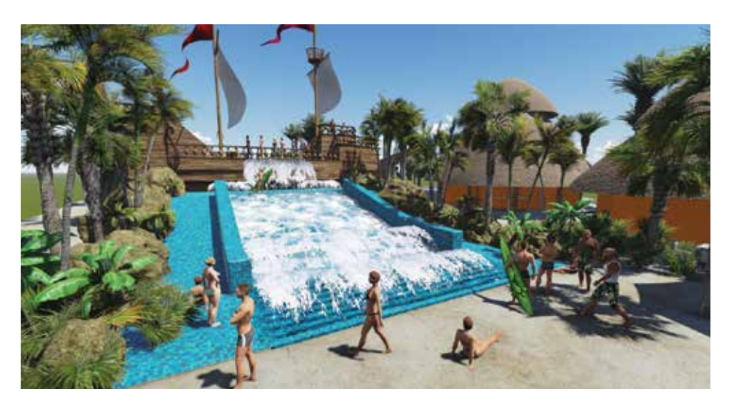
Pirates Island Water Park & Surf Ride Pool