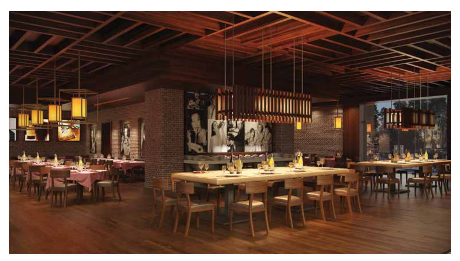
La Trattoria Ristorante Italiano